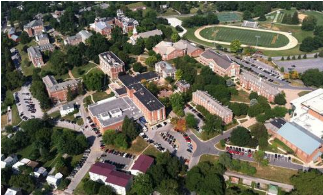
Westminster, Maryland (founded in 1867)