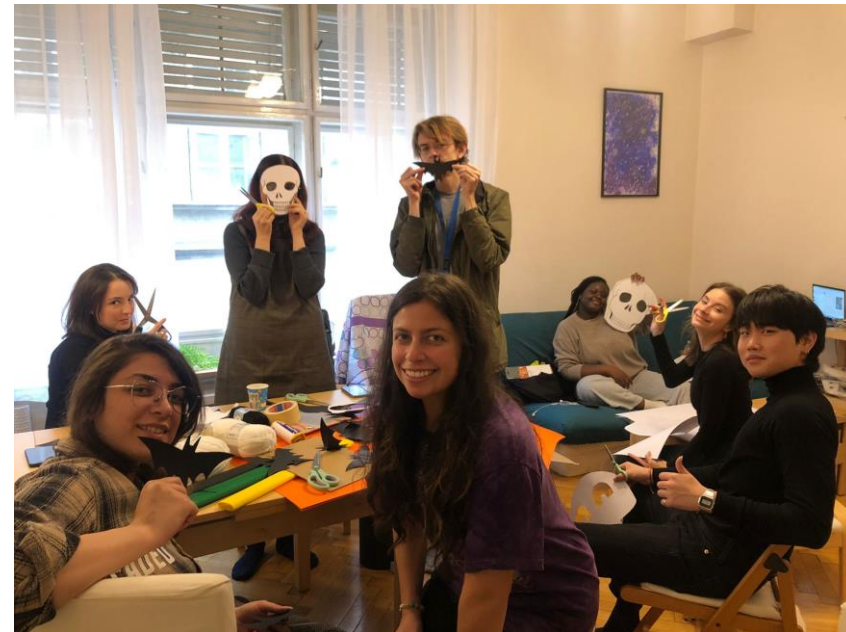
Left: Internship w/the American Corner, US embassy; Right: Student Advisory Council and peer mentors