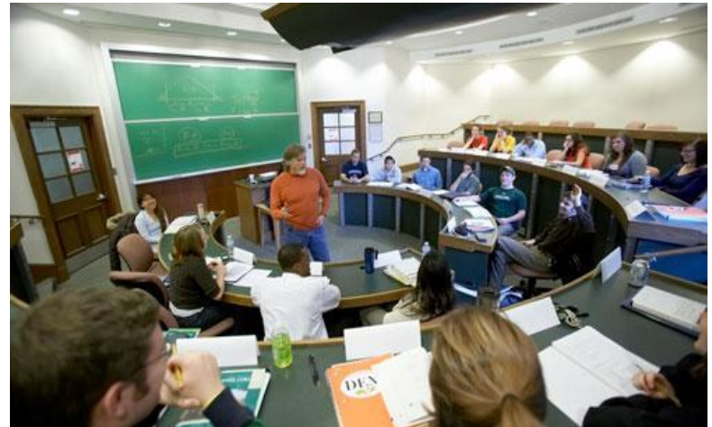
Business administration course, Westminster, Maryland campus.