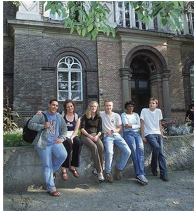
Budapest, Hungary (established in 1994)