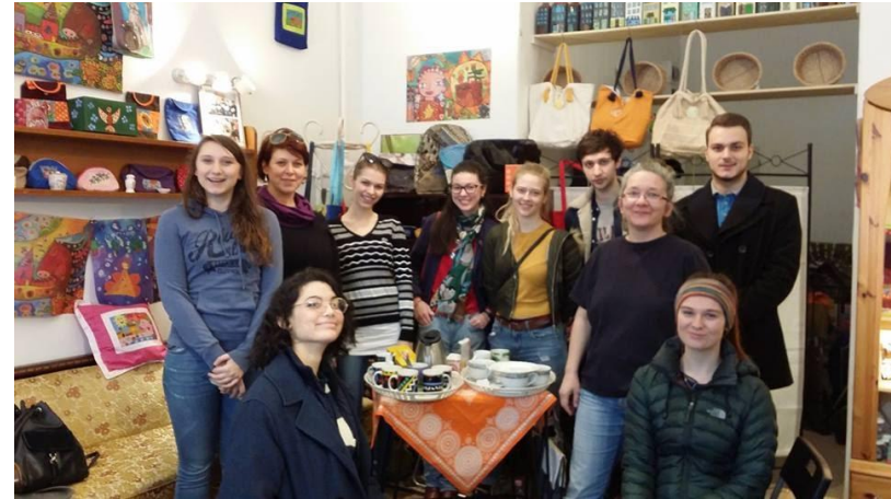
Art course visiting local gallery in the 8 th district.

Plus minor programs in all of these areas, as well as Journalism & New Media, History, and Cinema Studies.